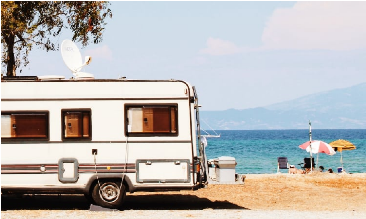
50 Amp RV (Reference: decideoutside.com )

The purpose of today's post is to equip you with more knowledge about RV electrical stuff, which includes an overview of what 50-amp service even is.