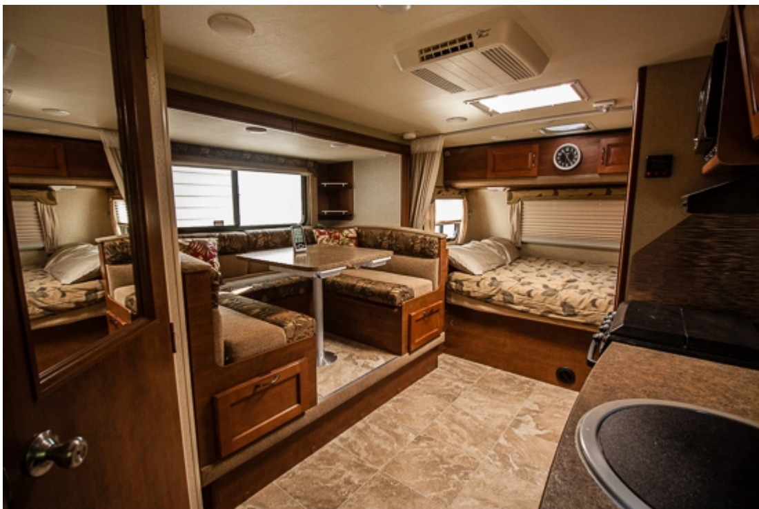
Calculating power usage in an RV (Reference: trailertraveler.net )

Keeping your needs in mind versus your wants is important. It would be nice to have power for your entire rig and all major appliances at once, but your budget and generator size may prevent that from happening.